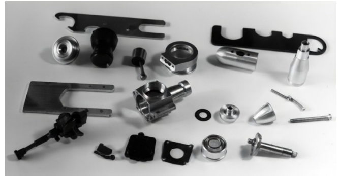
The components of the new COX Queen Bee. Spanners are supplied. Note exhaust collector and 2 piece muffler end long beam on engine mount, left centre. Throttle is separate from back plate, which retains reed valve body. Did you ever see a simpler crankshaft?

Look for the Cox Queen Bee in your local hobby shop, which should contact Southern Models for supplies. M.B.