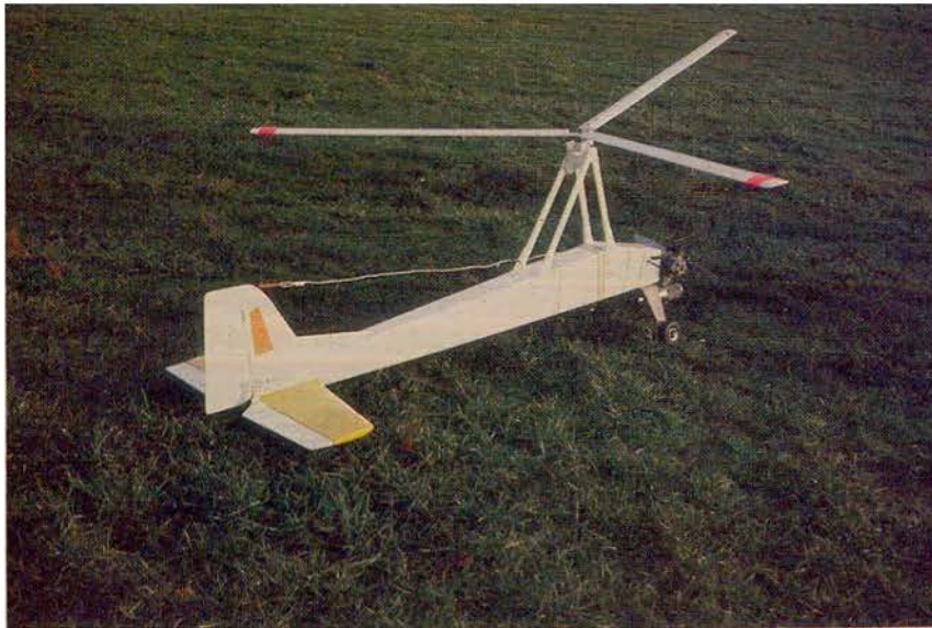
LEFT: The author's first attempt to build an RC Autogyro. The rotor is three bladed.