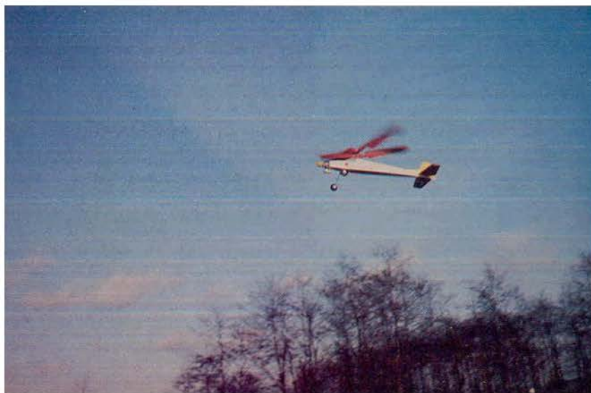
The Super Libelle in flight.

The test flight of this twin rotor version was the first success and showed that this could be the right way to approach a radio controlled autogyro. Some modifications had to be made to find the right location of the Center of Gravity, to develop a practical rotor design and to find the best angle of the rotor axle. A lot of test flights (and repairs) had to be performed to come to this final design, called “Super Libelle”. A 3-channel radio was used to control elevator, rudder and