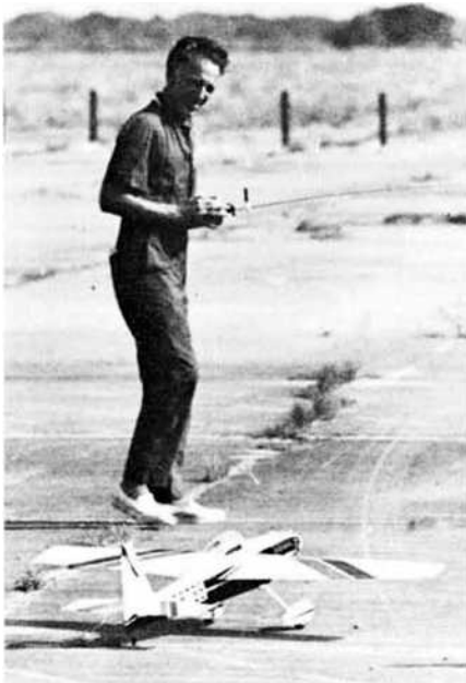
The author/designer, all decked out in flying togs, taxis the Akro to takeoff position.

Draw a straight line parallel to and 3/16 inch above thrust line for wing cut out, use root rib and draw wing section outline 3/32 inch wider than root rib to allow for 3/32 inch sheeting on wings. Draw a line parallel to and 9/16 inch above thrust line for the stab location and make a 3/16 inch slot for this, or, cut top off (see photo) and use blocks to fair in the fuselage over the stab. Mark angles of front and rear of turtle deck piece.