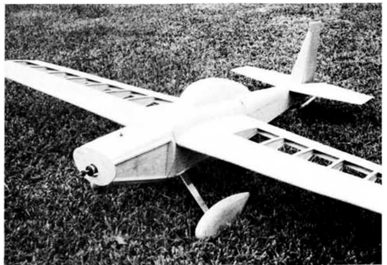
The almost completed bones. Cheek cowls are 1/64 ply wrapped around bulkheads shown here. Canopy is masked for protection.