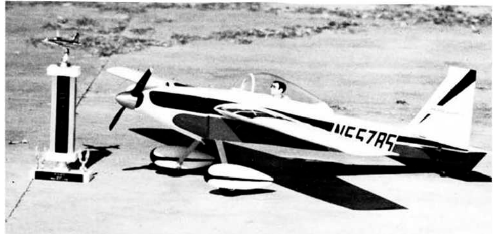
Ship is balsa and ply construction throughout. Only a few weeks old, and a trophy winner already. Akro placed second in scale at Corpus Christi Even cheek cowls are formed of 1/64 plywood. Internats contest, was judged by well known scaler. Tom Dean.

Cut the side to shape, making wing cut out and angle for turtledeck (save turtle-deck piece.) Use the side just cut out as a pattern for the other side.