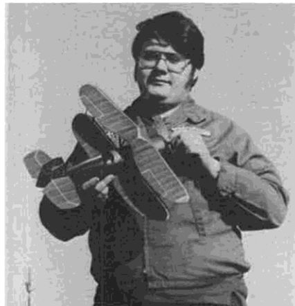
The author with his attractive biplane. Large stab area is evident in this photo.

The fuselage is started by cutting out all the formers and other small pieces. Make the formers out of soft balsa, as they don't carry any structural loads. Fill, sand, and paint the formers that make up the backrests and instrument panels.