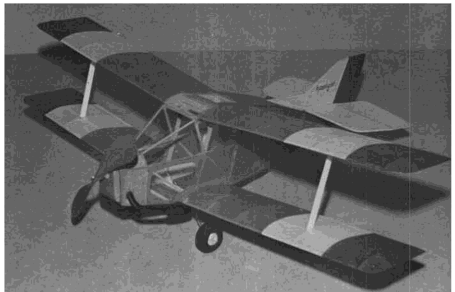
Wasn't it nice of Dick to cover his model in the same color scheme as the full-size aircraft that appears on the magazine's cover? This airplane just has to be done in R/C. Wonder who'll do it?