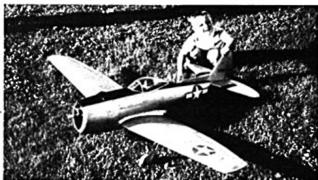
Don't know name of author's other scale project but he is proud of his Pop's good work in scale. Pilot and cockpit details have been added.

The P-47N makes a good choice for this type of model. However, so do a surprisingly high percentage of successful full-size aircraft. Aerodynamic layout comparisons are remarkably close, even with R/C contest types. It is also interesting that scaled wing loadings (weight \frac{1}{3} ), power loadings (within a factor of 2 or 3), flight speeds, and even airfoils obtained, particularly for WWII jobs. The most significant deviations from model proportions is the low stabilizer area common to full-size planes. This is probably not as critical as generally supposed ( Continued on page 54 )