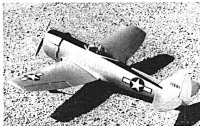
First chance we had to see the nose brute was at the '62 Nats at Glenview, Ill., and in its first year of competition, did a creditably good job.