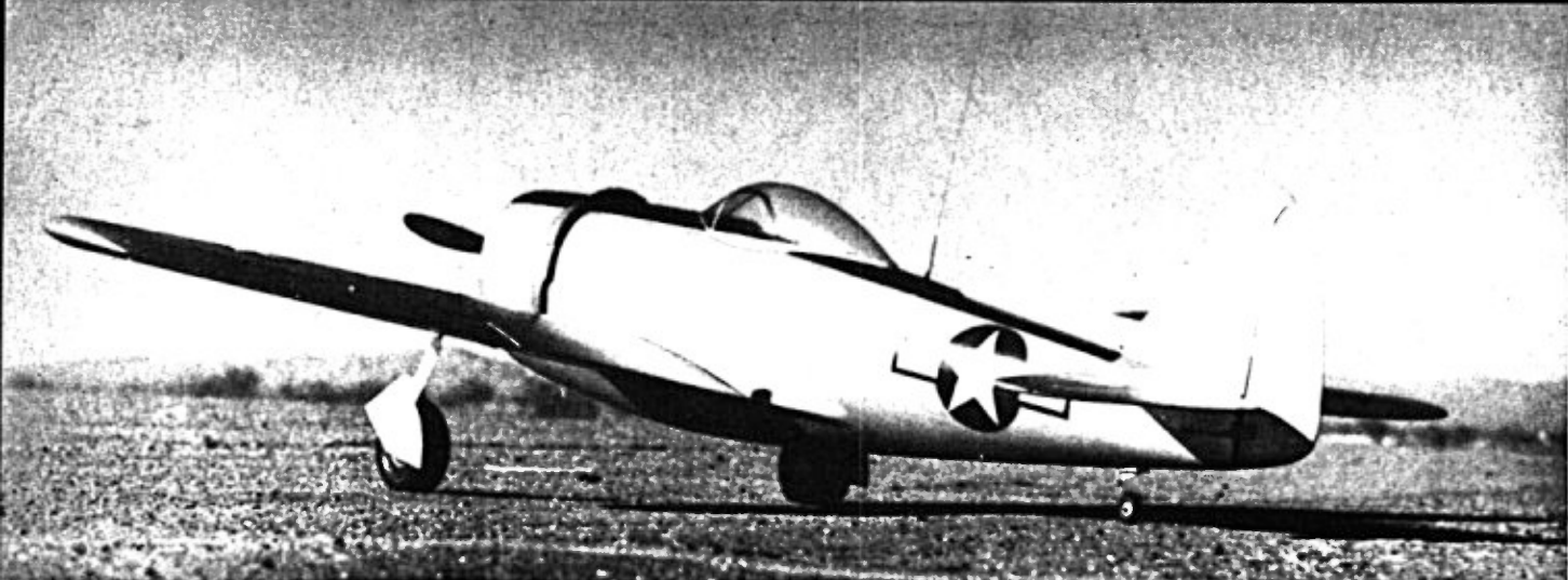
Rear view of the "Jug" shows attention to good scale details to help garner those extra contest points. Louvered cowl helps engine cooling.