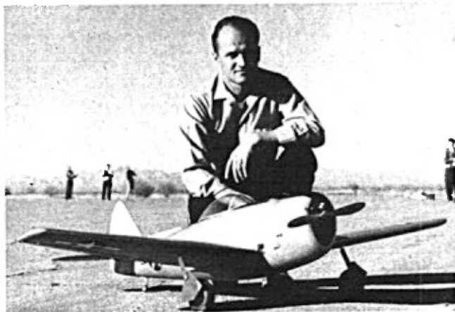
Our author with the fixed gear version of the P-47N. Engine is really lost under that huge cowl, but it certainly does permit good cooling.

Steady as a rock is the best description of the flying qualities of our "Jug." Wheels down, landing approach as seen over the pilot's shoulder.