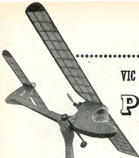
Margaret Smeed admires hubby's handiwork. Sweep-back equals dihedral angle, giving optical illusion of a flat wing in this view.

J UST about all of a model's ailments centre round, or affect, the C.G. To design a trouble-free model is therefore simple—don't let it have a C.G. "Pushy-Cat" is one model which definitely hasn't one, for, although it balances where indicated on the plan, the vertical factors bring the true C.G. to a position almost one inch outside the airframe, in thin air! Does this produce visions of the model scudding away and leaving its C.G. standing?!