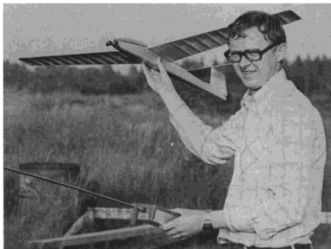
The author getting ready for a flight. Swept-forward wing and T-tail add a distinctive appearance to the little bird.