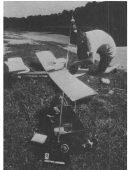
Author Dave Malt up the radio compartment before another flight. Been wading, Dave?

The fin is made up of three pieces of sheet balsa epoxied together. Before these pieces are assembled, make a slot in the 1/4 inch balsa center sheet for the push rod outer tubing. The fin is epoxied together with the tubing inside.