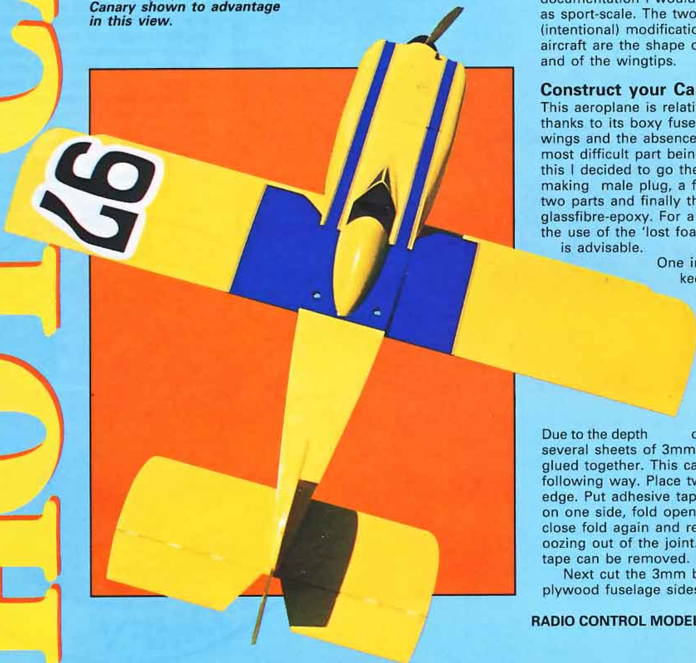
Unusual proportions of Hot Canary shown to advantage in this view.

I ALWAYS have had an interest in obscure aircraft and in pylon racers (the real ones). So why not combine the two? About two years ago I drew the plans for this aircraft but because of lack of time (the eternal nightmare of a model builder) it was put away.