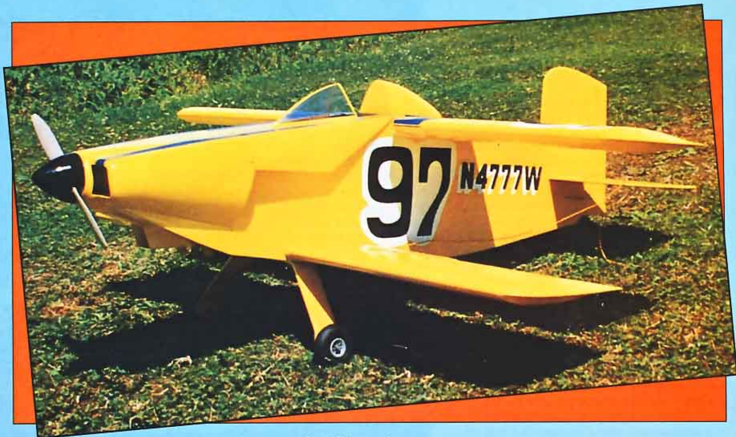
Hot Canary spans one metre – and is 1100mm long. Original was powered by an OS 46 SF ABC.

From Belgium comes Stefan Van Nieuwenhove's sports scale racer for .45 to .50 motors