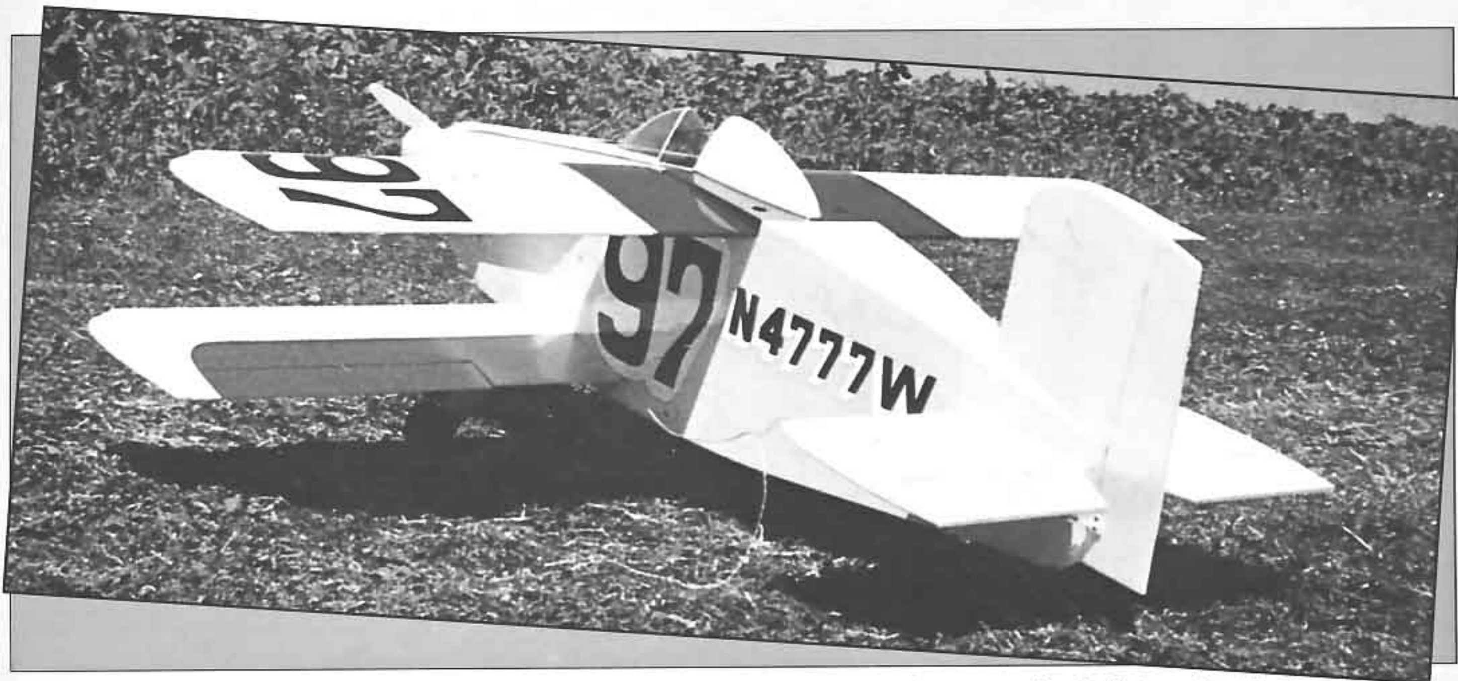
Hot Canary looks a fast performer from any angle. Turns best when rolled to 90 degrees and pulled through with elevator.

This can be done the following way. Cut two pieces of glassfibre weave. One piece with the fibres running 0-90 degrees and the other -45/+45 degrees (see plan). The -45/+45 degrees weave is needed to get the necessary tensional stiffness. The shape of the pieces assumes that the resulting landing gear will be thickest in the middle as the