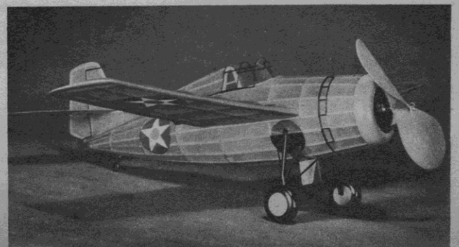
Under view and tuck-up wheels for a Jap view of the Wildcat. Note the well-proportioned prop with free-wheeling, for astounding performance.