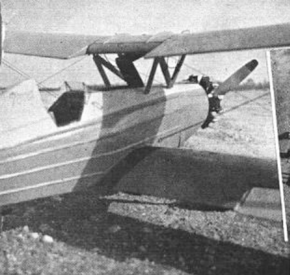
Structure has been kept as simple as possible, with scale-like spacing and open frame realism.