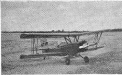
Aero .35 engine in cowl. Others are suitable.