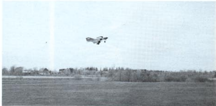
The Grasshopper looks a bit like a control line ship—it mostly consists of straight lines, making construction easy. It flies in a very stable configuration, but is highly maneuverable.