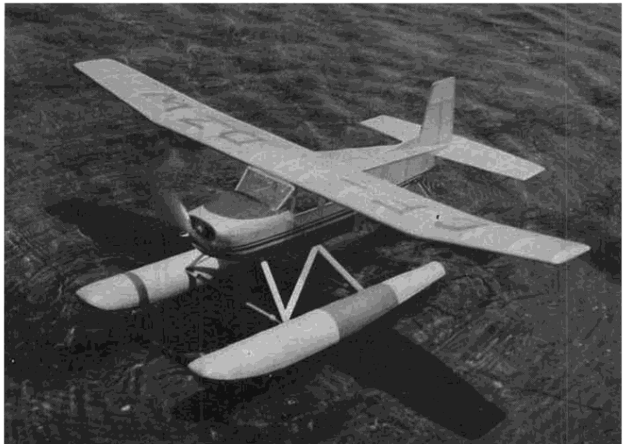
Shades of the old Scientific "Red Zephyr!" The flat center section with tip dihedral seems almost too good to be true . . . er . . . scale!