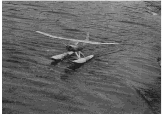
The Found on a takeoff run. It becomes "unglued" with only a moderate amount of power.

very far behind the trailing edge of the wing. This was done because it's amazing how much rubber it takes to R.O.W. a seaplane model, and it's important to have the rubber C.G. close to the flight C.G. Otherwise you have to reballast the the model every time you increase the engine power.