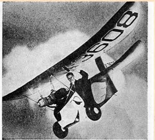
The author squeezes into his Flea (He's a trick photography expert, folks!)

THE name Flying Flea , or better yet Pou Du Ciel , will remind old-timers of the days when nearly every basement carpenter had a Flea under way. This radical departure in the ultra light plane field was dreamed up by a quiet little Frenchman, Henri Mignet. He officially unveiled it to the aviation world at the Paris Aero Show way back in 1934 and within two years "Fleas" were swarming over the European Continent. They were just catching on here in the United States when the craze died out as fast as it had started. Possibly the main cause for this was the fact that due to so many being constructed by inexperienced persons, there were a few serious crack-ups. Regardless of the faulty jobs turned out by some of the basement workshops, the design has a great deal of merit. The ships were powered with motors ranging in size from 20 to 35 hp, and ready to fly, checked in at the phenomenally light weight of 250 lbs! No wonder they could take-off, fly, land again and come to a stop within a distance of 300 ft. The model Flying Flea weighs all of 7 oz. yet it is plenty sturdy and can take the roughest treatment because of its compactness. By devoting just a little extra time to the novel paint job as used on the original model you will be well rewarded when the modelers gather around to stare at it. Begin fuselage construction by cutting out the two sides from 1/16" sheet balsa