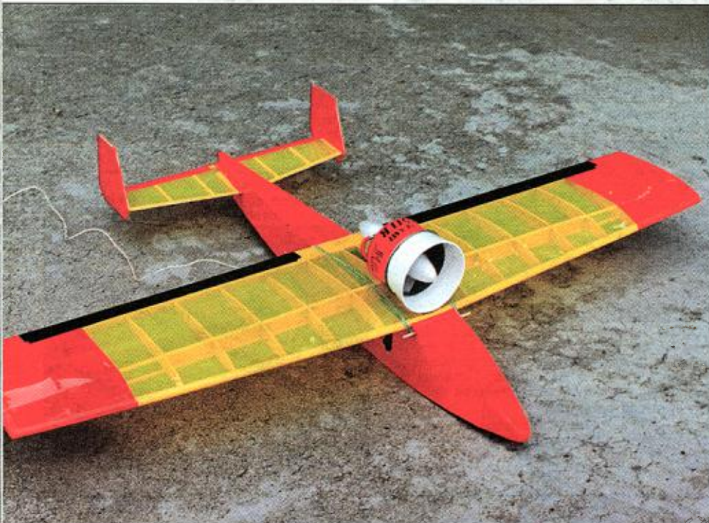
The Electro-Screamer as built by MB columnist Roger Jaffe is covered in bright colors of MonoKote and Ultracote for good visibility. Model was designed around HiLine's Red Flame Blaster fan unit, which sells by itself for $25.95 or complete with a six-cell 600-mAH NiCd pack for $39.95, from HiLine, P.O. Box 11558, Goldsboro, NC 27532. S&H runs an additional $2.50.

Before starting construction, we need to make a statement on safety. Electric aircraft can be very dangerous due to their instant-on ability. The use of a ducted fan introduces additional safety concerns. The unit should always be powered up and down