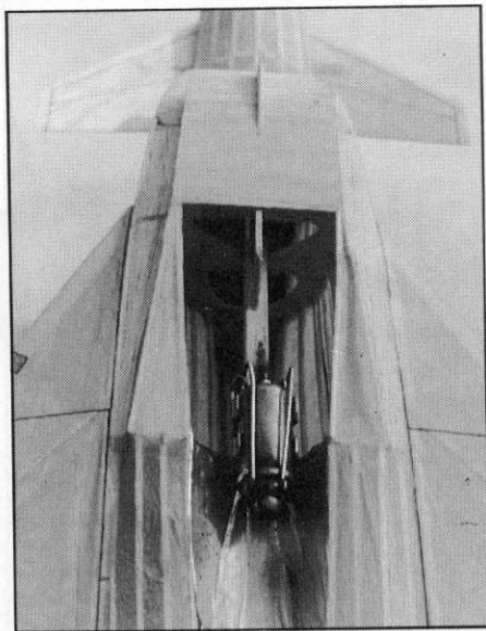
Close-up shots show the Jet-X motor in its foil-lined duct, and intake and foreplane detail. Construction shots below.

with 'bands' of tissue, which wrap around, filling the space between two formers. Because of the fuselage contours some of these bands will turn out not to be true, parallel strips. I found it best to mark the tissue on the fuselage with a very soft pencil before cutting. Covering the wings is straightforward but remember to place the tissue on the wing with the grain running parallel to the leading edge.