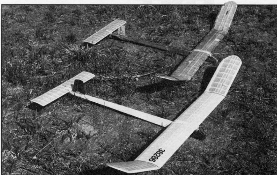
Druids old and new. Immediately after taking this picture the posh one was lost in a forest. Back to the building board Jim!

Add autorudder stops, either a simple length