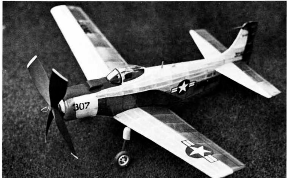
Vroom! All 13 inches of AD-4B pass overhead. Modeled after a particular aircraft shown in color in the Profile Publication (No. 60), this model has nice proportions for a free flight model. stands out in its basic red and white with black trim. Colored tissue used for covering.