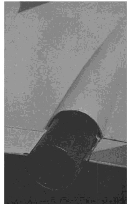
Simulated "exhausts" move with elevator. Help create that scale-like appearance.