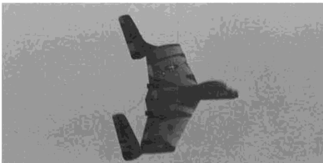
Unusual construction techniques yield a very light, inexpensive flying wing model. Semi-scale look gets attention fast.