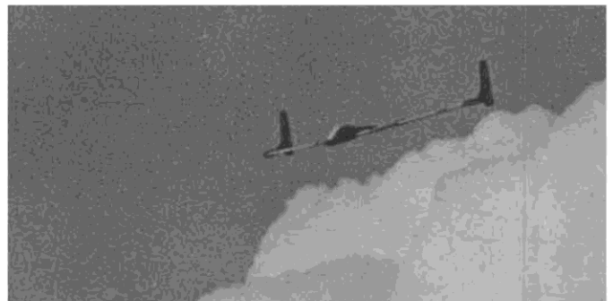
Combat flying fantasies are hard to suppress with the Cutlass II and weather like this! Flights are fast, smooth, realistic.