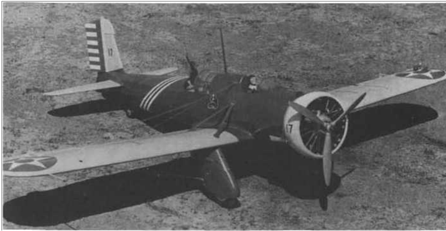
All rigging is permanently attached to the wing, unbolts at fuselage when broken down for transporting. Right trim is put in by radio before ukie flights. Roberts control for U/C.