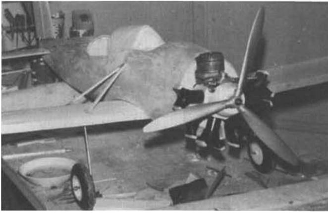
Dummy engine is entirely built up from scratch (Sorry about that, Williams Bros! At least he used your wheels). Webra 60 R/C engine.