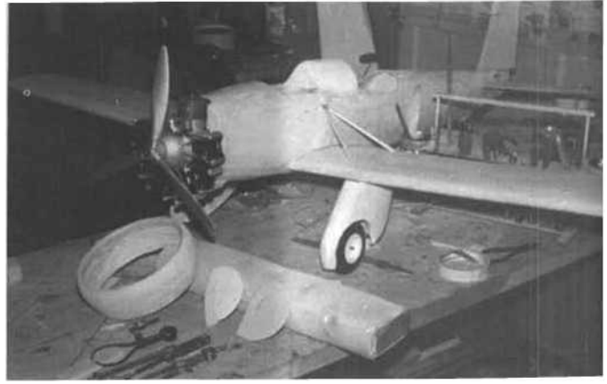
Remaining cylinders are attached to shaped balsa cowl. Engine is almost completely hidden. Baba skin throughout.

Trim as necessary so that the wing is 90° in both axis of fuselage. Hold in place so that stab can be installed, check for squareness. Glue and let dry. Install fin on centerline of thrust and 90° to stab. You know, with all this gluing and checking it's time for a beer. It's rough, but doesn't look too bad. Take a picture. As a matter of fact, take pictures all through construction.