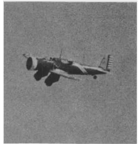
Prototype was still in use at beginning of WW II. Had short use as trainer.