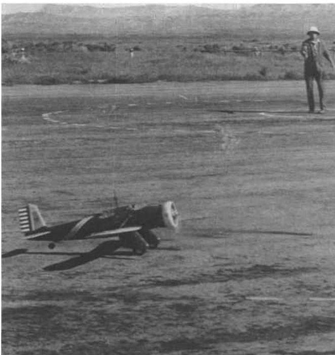
Charlie starts a takeoff. Note the right main and tail wheels are off the ground. Rudder and ailerons trimmed right for U/C.