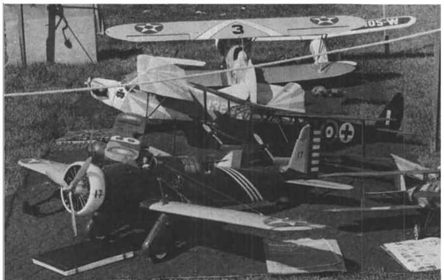
The 'Shrike' with some select company- Note Noal Hess' Boeing F4B-4 in background. Prototype Shrike was Army Air Corps' first all metal plane. Model has 66 inch wingspan.

Check for squareness ... no down thrust or right thrust. Mark the crutch assemblies with bulkhead locations. Epoxy crutch to No. 1 and No. 2 bulkhead assembly. When dry, assemble bulkheads Nos. 4, 5, 9, 10 and 12. Check that these are 90° to the crutch and straight in the top view. When dry, install the balance of the bulkheads. Install 1/16 balsa sheeting between bulkheads 1 and 2, 2 and 4, 5 and 8. Install 1/4 sq. stringers as shown, also bellcrank rails and stab blocks. Now skin the frame with 3/32 balsa sheets. In tight contours, plank with 1/2 x 3/32 inch strips. Do not cover the bottom rear so as to install the push rods later. Fit wing into fuselage.