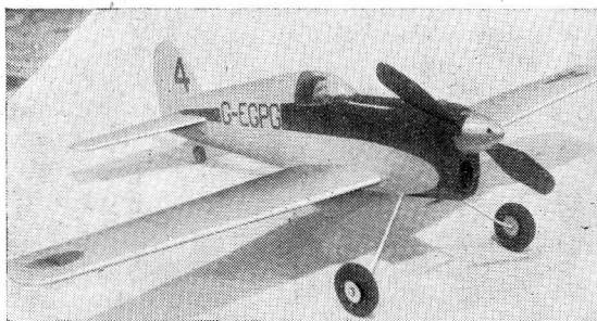
Lazy Lizzie, at left was a slightly larger and much earlier version of Black Chiffon. Note fin numbers, Chiffon in heading is No. 8, plan is of No. 9.

The prototype was tastefully decorated with black fuselage and flesh pink surfaces—with some very tasty lace work around the wing roots, such as befits the choice name, we leave you to your own ideas for colouring of your model.