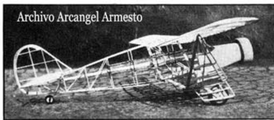
The completed uncovered framework indicates close adherence to the large plane design