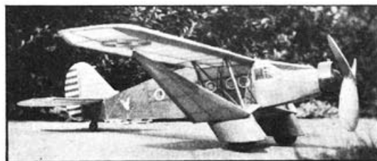
Embodying many realistic details of the full scale plane, it provides a real thrill when in flight

Sand each piece of wood that goes into the model. This will remove the "whiskers" which have no structural strength, yet burden the ship with useless weight.