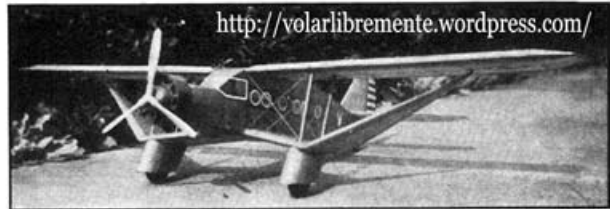
The finished model with scale propeller