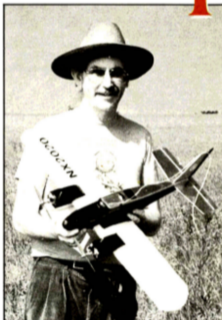
It flew, it flew! One proud designer.

The eagle-eyed will notice that the drawing is slightly different from the photos. The nose has been slightly lengthened and the windscreen moved forward. This has three advantages. The longer nose gives a little more protection for the engines, it also means that the 1.1/2 ounces of lead that I had to put in the nose can be omitted and