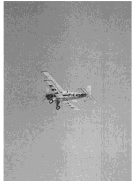
This, and photo at left were taken at Mile Square, Fountain Valley, Ca. during contest.

The model will fly on six strands of 3/16 rubber, but does better with eight. Nevertheless, I suggest starting with the smaller motor and working up to determine your particular thrust line adjustment requirements. The model in the photo required about an eighth of an