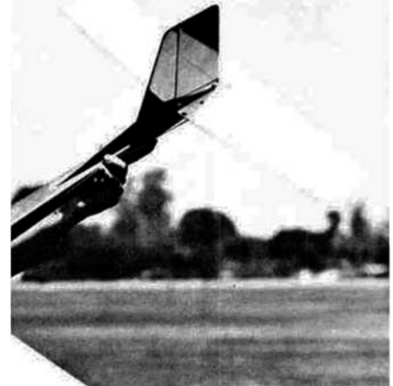
Rudder appears to be transparent. Super-Poxy finish has that much gloss! It's also very light.

The horizontal stabilizer bolts onto this