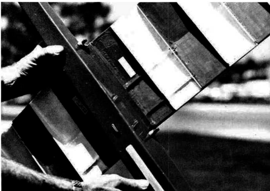
Close-up shot of underside reveals wing joiner tubes fiber glassed, with cloth, to the 3/8 inch leading edge sheet. Tow hook is epoxied to ply sub-floor and to front wing dowel. Ace skid.

I used K & B "Super Poxy" finish for everything except the tail and found it to be almost ideal for high performance sailplanes. Use one coat of a good wood filler, sand it all off, leaving the holes filled. Then use one coat of K & B primer, sand with 400 - lightly. Add one coat of K & B as per their instructions, and wow! Very little weight increase and it looks like a million. If you really want to show off, let the color cure for a couple of days and rub down with compound. Put on a coat of hard wax and buff. Better wear dark glasses so you won't be blinded.